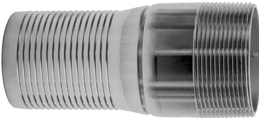
ZINC PLATED STEEL